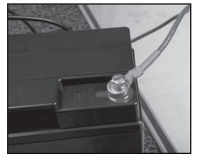
5. Remove right foam battery cover and set aside. Unscrew the bolt from the red "+" terminal of the battery. Remove red tape from red "+" wire and bolt to the terminal, use same method as step 2.