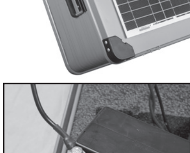
3. Remove plastic terminal ccover and unscrew the bolt from the black "-" terminal. With washers still on the bolt, attach the black "-" wire to the "-" terminal.