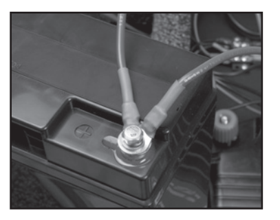
2. Unscrew the bolt of the red "+" battery terminal. Remove red tape from red "+" wires. Bolt the red wires to the red "+" terminal. Washers should be between the bolt and the wire. Red wires and terminal connection should appear as shown on left.