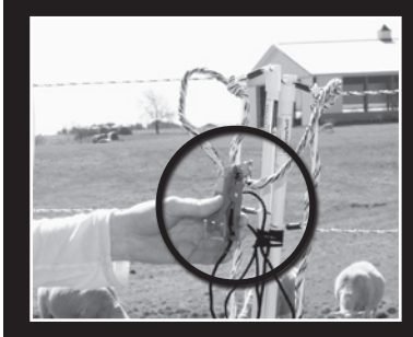
2. Attach red clip to the portion of the fence that is to be energized.