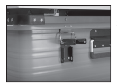
8. Close and secure energizer lid. Do not shut black and red fence leads in the case.