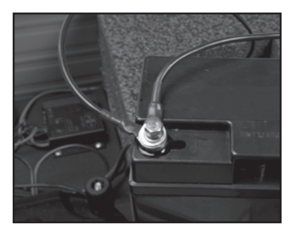
6. Unscrew the bolt from the "-" terminal and bolt in black "-" wires.