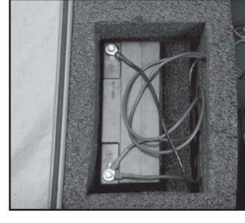
4. Replace foam lid.