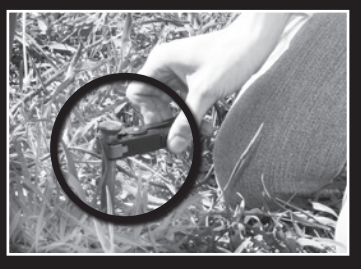
1. Insert ground rod next to the energizer. Then connect black clip to the ground rod (as shown above).