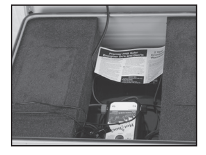
1. Looking at the inside of the PRS unit as in the picture, remove the left foam battery cover and set aside.